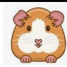
4 Ginny Pigs